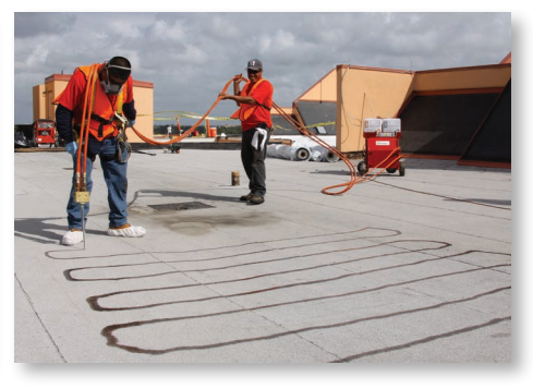
Firestone XR Bonding Adhesive