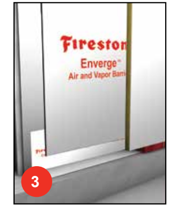
Enverge CI Exterior Wall Insulation